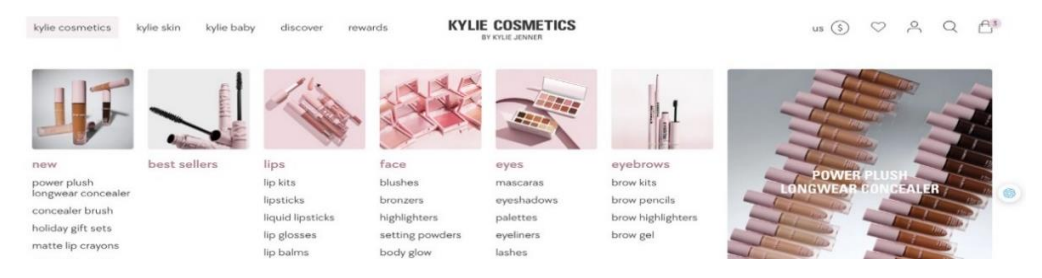
Figure 3. Kylie Cosmetic's navigation menu

However, this approach has its limitations as all the options are not displayed on a single screen. Customers have to click on the right arrow on the screen to view other options. Having to continuously click like this to find the product they want can be inconvenient and may test the patience of customers. Adopting a conventional vertical dropdown list for the navigation bar is recommended. Benchmarking against other brands could provide valuable insights. Figure 3 shows that Kylie Cosmetics organize their categories and subcategories in a simple manner with a vertical dropdown list, yet manage to leave a distinct impression by using relevant imagery for each subcategory, such as face, lips, and eyes. Moreover, when one hovers over the Kylie Cosmetics category on the navigation bar, all the makeup-related subcategories appear within the same frame. Beneath each subcategory, there's a detailed list of products within that category, making it easy for customers to click and access the webpage without much effort.