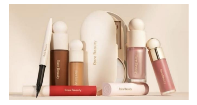
Figure 1. Rare Beauty's makeup products

A key strength of Rare Beauty lies in its consistent design elements, including color schemes, typography, and imagery, which are cohesive on the website. Figure 1 comes from Rare Beauty's product page of the website. As one can see from the figure, the color scheme of Rare Beauty's website is a soft, neutral nude pink, which gives viewers a comfortable and warm feeling. The graphic design predominantly uses circular elements, creating a consistent visual identity with Rare Beauty's product images. All Rare Beauty's products have a rounded shape, as opposed to the sharp angles found in other cosmetic brands.