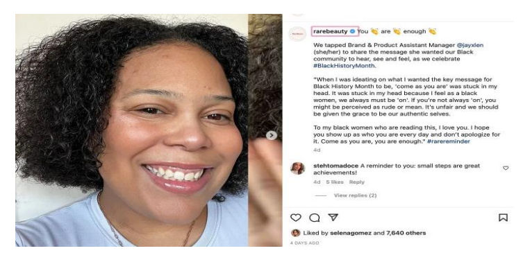
Figure 4. Screenshot of Rare Beauty's Instagram account

Secondly, on Instagram, Rare Beauty curates a diverse collection of posts that address various contemporary social issues, demonstrating engagement with its audience on meaningful topics, which further can enhance target consumers' loyalty [26] and the brand's reputation [27]. Their posts include pictures, graphics, reels, and user-generated content. In their pictures, they show their products, honor and display employees, and customers wearing their products. They put captions in the reels to make sure their message is getting across as most users are scrolling without their sound on. Furthermore, as one can find in Figure 4, the Rare Beauty Instagram account has a collection of posts touching on various messages and essential subjects on social issues, such as #BlackHistoryMonth.