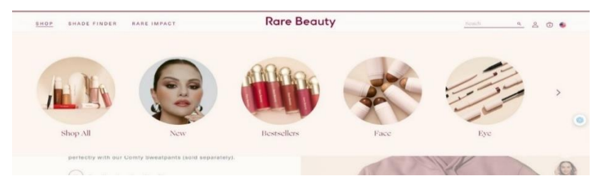
Figure 2. Rare Beauty's navigation menu

Secondly, the navigation bar could go against consumers' smooth browsing. As Figure 2 shows, Rare Beauty's navigation bar on the upper left corner consists of three main sections: "Shop", "Shade Finder", and "Rare Impact". Under the "Shop" section, there are options such as Best Sellers, Face, Eye, etc. Instead of displaying a series of clickable text phrases like other websites, Rare Beauty incorporates images along with text to enhance the visual appeal of the products.