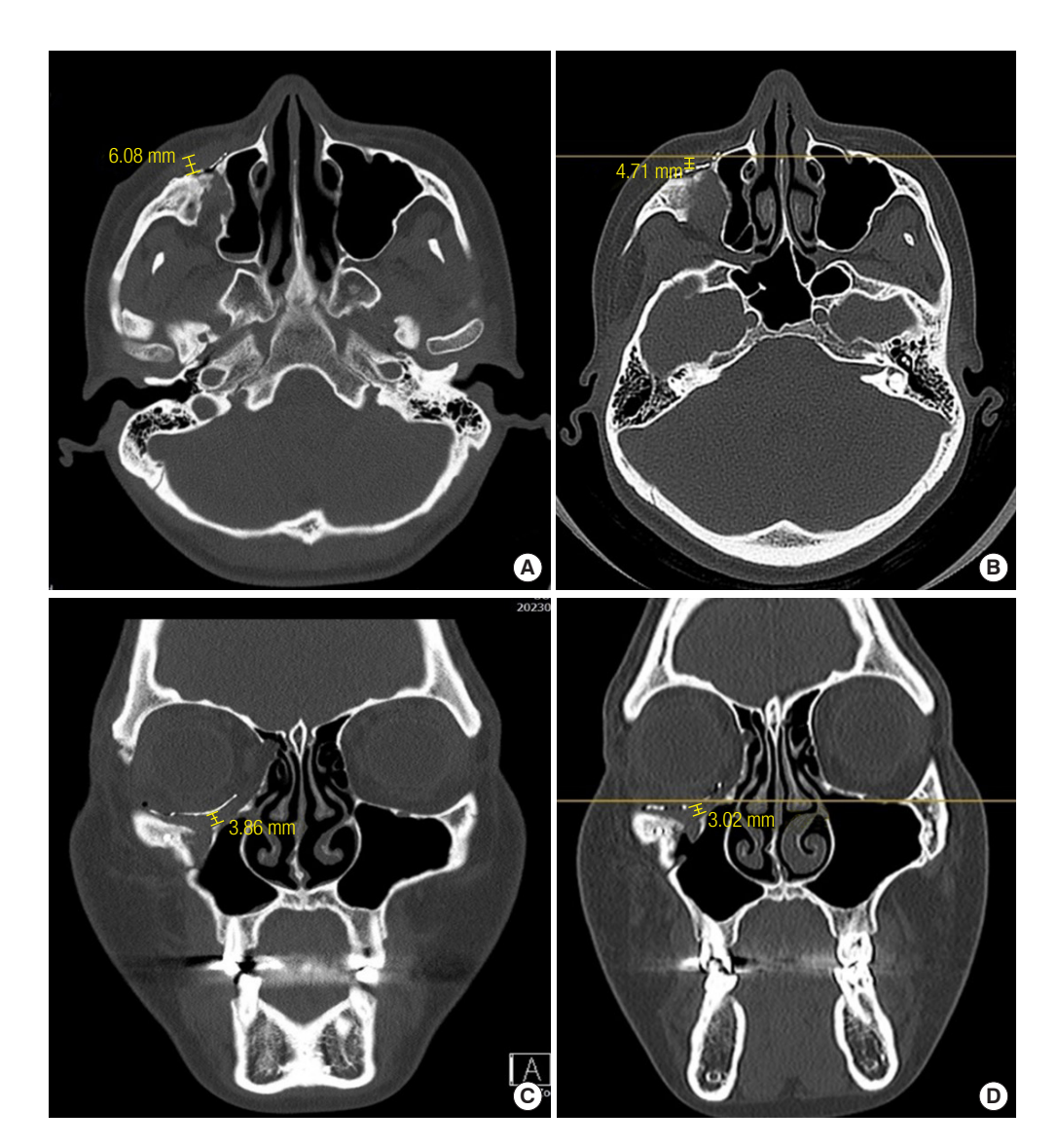
Fig. 3. Immediate postoperative orbital computed tomography scan. (A) Hydrated acellular dermal matrix in the depressed maxilla measured approximately 6.08 mm, effectively filling the soft tissue void. (B) The thickness of the soft tissue substitute 6 months after the reconstruction is approximately 4.71 mm. (C) The initial tissue height on the orbital floor is approximately 3.86 mm. (D) It remains stable at 3.02 mm as seen 6 months after the procedure.

Six months post-surgery, the patient reported a notable improvement in her condition. The previously depressed area on the patient's infraorbital rim had undergone significant improvement (Fig. 4). Additionally, the discrepancy in exophthalmometer readings, initially recorded at 2 mm preoperatively, was markedly reduced to 0.5 mm. The diplopia experienced during downward gaze had completely disappeared. This favorable outcome resulted in a high level of satisfaction on the part of the patient, underscoring the successful nature of the intervention.