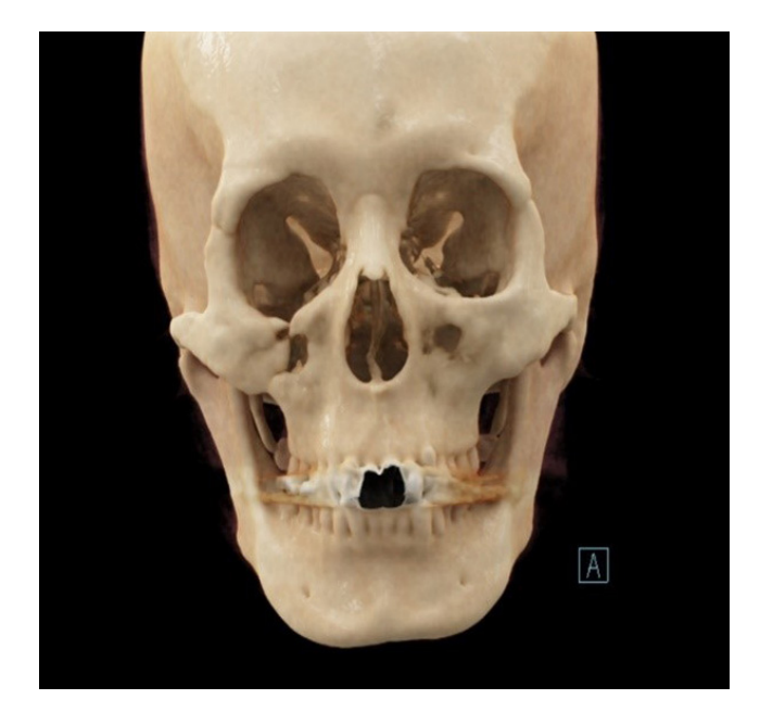
Fig. 1. Preoperative three-dimensional facial computed tomography scan. A 27-year-old woman presented with a depressed contour of the right lower eyelid area and enophthalmos, resulting from a fracture that caused the downward displacement of the right orbital floor and misalignment of the zygoma.

Using a subciliary approach, we began by carefully releasing scar tissue until we reached the periosteum. Upon making the periosteal incision, we encountered the previously applied implant (Medpor), which, had failed to maintain its position. The entire orbit floor, along with the implanted Medpor, had descended, leading to an unsuccessful volume correction. This necessitated the removal of the implant and surrounding scar tissue. To effectively address the orbital floor correction and enophthalmos, we opted for a different approach by placing a 3 mm thick hydrated ADM, CGDerm One-Step, directly onto the orbital floor. This step was pivotal not only for providing a stable foundation for the titanium-reinforced fan plates (Synpor) but also for its significant role in augmenting orbital volume. The switch to ADM, coupled with titanium implants, was driven by the need for a durable volume correction that the previously used solid implant could not achieve. Given the patient's history of diplopia and limited eye movement, our strategy focused on ensuring a flat and stable orbital floor, a goal made achievable through the synergistic use of ADM and titanium