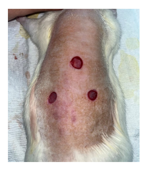
Fig. 1. Wound generation on back of rat with 8-mm-diameter biopsy punch.

This experimental study involved 12 Sprague-Dawley rats, approximately 8 weeks old; they were maintained under appropriate temperature and humidity conditions with food and water provided throughout a 7-day acclimatization period before the