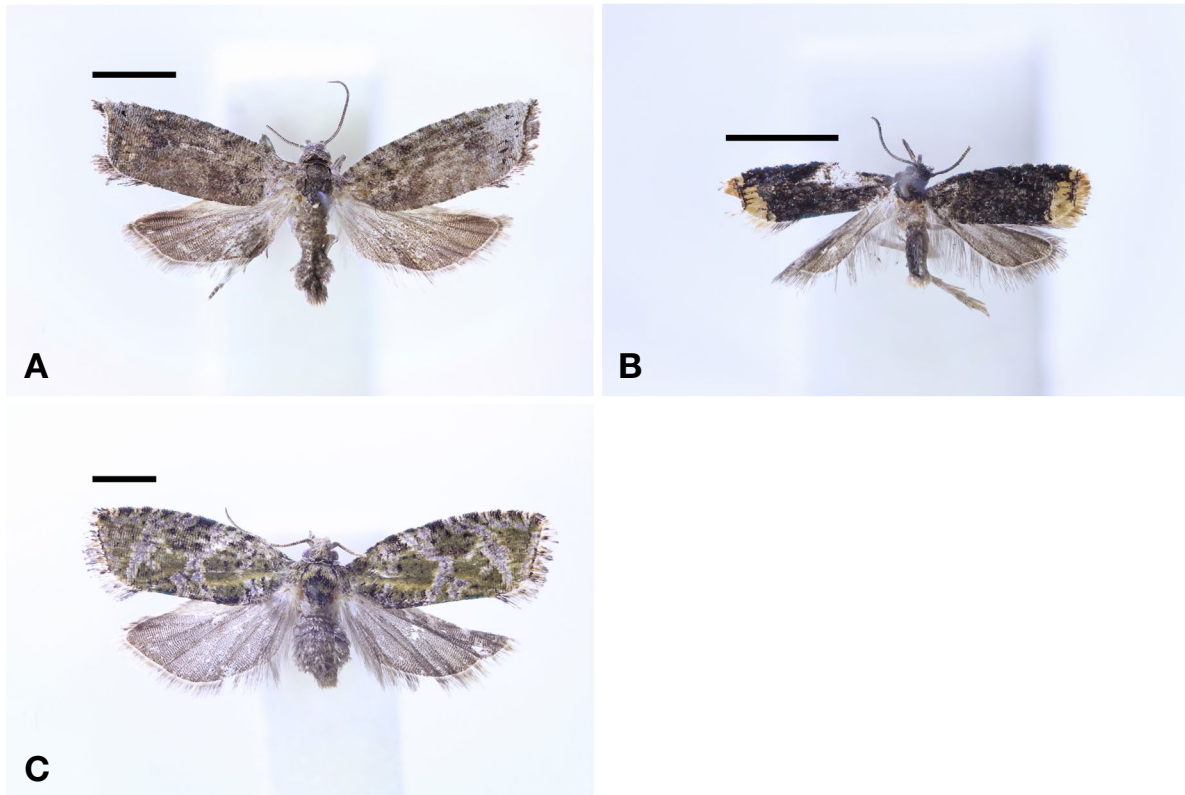
Fig. 1. Adults. A, Matsumuraeses ussuriensis ; B, Pseudacroclita luteispecula ; C, Zeiraphera hiroshii . Scale bars: A-C=2.0 mm.