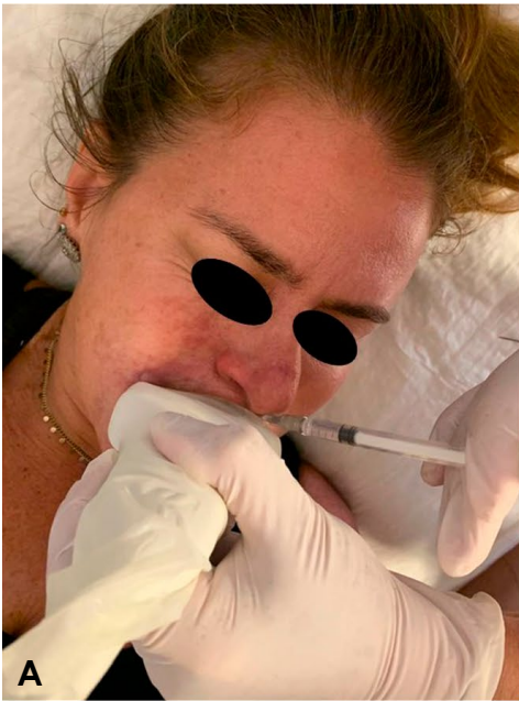
Fig. 3. Ultrasonography images of the patient’s face during hyaluronidase application. A. The transducer positioned transversely during application of the enzyme. B. Ultrasonographic image of the right upper lip region to visualize the needle (arrows), hyaluronidase (▲: hyperechoic aspect). C. Ultrasonographic image of the right lip commissure region after the application of hyaluronidase. D. Doppler ultrasonographic image of the right upper lip region with the transducer in a transverse position showing the reestablishment of blood flow in the region of the subnasal artery, a branch originating from the superior labial artery, after application of hyaluronidase. E. Doppler ultrasonographic image of the right upper lip region, with the transducer in an oblique position to visualize the reestablishment of blood flow in the area surrounding the superior labial artery after new application of hyaluronidase. E: epidermis; D: dermis; ST: subcutaneous layer; OM: orbicularis oris muscle; SM: submucosa; V: vestibule; T: teeth; ▲▲: labial vessels; MX: maxilla.