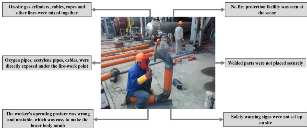
Fig. 1. Unsafe behavior provided by the researchers.