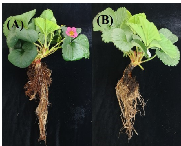
Fig. 4. Images of strawberry 'Guanha' plants grown in aquaponics (A) and hydroponics (B) for 98 days after transplanting.

z Asteriks indicate significant differences (t-test * p < 0.05), each value is the mean of 30 replications.