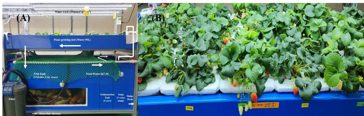
Fig. 1. The aquaponic system used in this study (A) and strawberries growing on the bed of aquaponics with perlite pots (B).