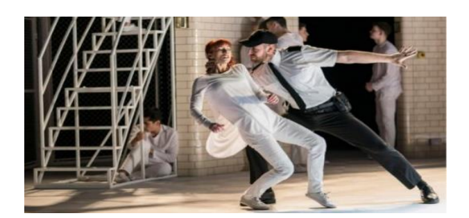
Figure 4. Tybalt Attempting Sexual Assault