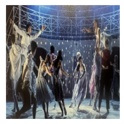
Figure 2. Party Scene of <Romeo + Juliet>

Matthew Bourne chose the theme of substance use to express the tumultuous rebellion of youth, capturing the essence of adolescent freedom. However, there is an implicit critique that highlights the dire consequences of impulsive choices regarding drug use, culminating in delusions, trauma, and suicide.