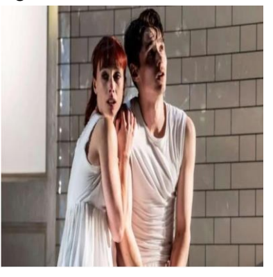
Figure 3. Trauma Experienced by Romeo and Juliet Figure