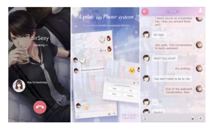
Figure 4. Mr Love: Queen's Choice

The game's dating system allows the player to increase the character's favorability by giving gifts, and the characters will also respond instantly to the player's touch commands, such as touching the head or hand to trigger the corresponding actions and lines. In addition, the more protagonist will regularly use sweet words of love, caring words, and sharing about life to enhance the romantic atmosphere with the player. Meanwhile, the game also simulates special events or festivals in the real world, such as birthdays and Valentine's Day, so that players can spend romantic time with their in-game partners. This design not only provides a free and varied relationship experience but also makes the social interactions in the virtual world highly consistent with real life, which greatly enhances the authenticity of the game and the player's sense of immersion.[10]