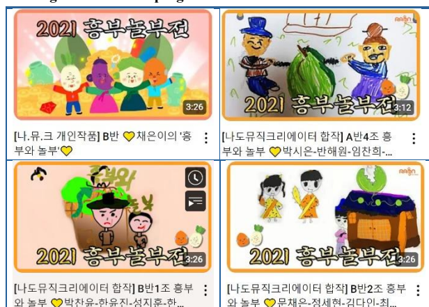
Table 4. Example of creative music fairy tale 'I am a Music Creator' convergence education program