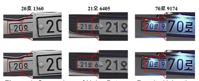
Figure 4: Comparison of Noise Between Results Using the Proposed Model and the Original Image

the outlines of characters and numbers are restored, with the restoration of the Korean characters '오' and '호' showing particularly remarkable improvement over Bicubic This enhancement greatly Interpolation. improves readability by more accurately reproducing the complex structure of Korean characters. Furthermore, it can be observed that noise has been reduced across the entire image, and there is also an improvement in the contrast between the background color of the license plate and the color of the text. Table 1 presents the confidence scores for license plate recognition corresponding to the images shown in Figure 3.