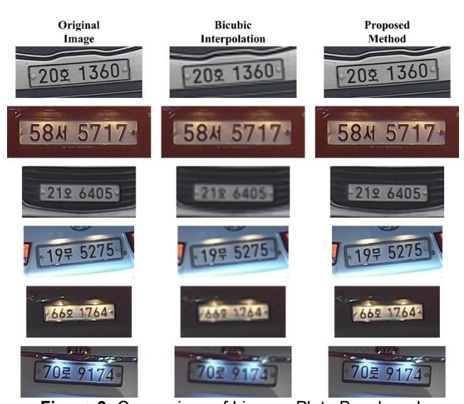
Figure 3: Comparison of License Plate Benchmark Datasets Using the Proposed Model

Figure 3 shows a portion of the results from performing restoration on a vehicle license plate dataset using the proposed method. It can be observed that the Proposed Method significantly improves the overall sharpness of characters and numbers compared to restoration using Bicubic Interpolation. In particular, for the cases of '21 \Omega 6405' and '66 \Xi 1764', the improvement is notably superior to Bicubic Interpolation. In each result, it can be seen that