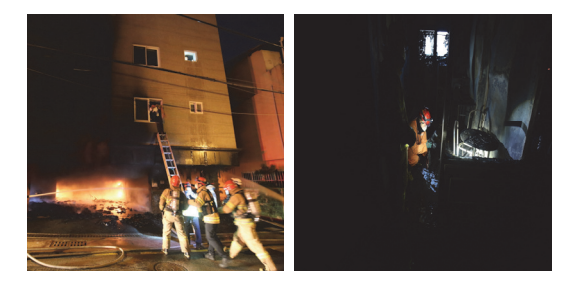
Fig. 1 (a) House fire being extinguished (b) After extinguishing a house fire

The fire safety labels for household appliances proposed in this study do not directly prevent or extinguish house fires. However, these labels can contribute to long-term psychological fire prevention and enhance fire awareness by raising awareness of the fire risk associated with household appliances, thereby aiding in preventing residential fires. Additionally, the National Fire Agency is implementing a project to supply basic firefighting facilities to each home.