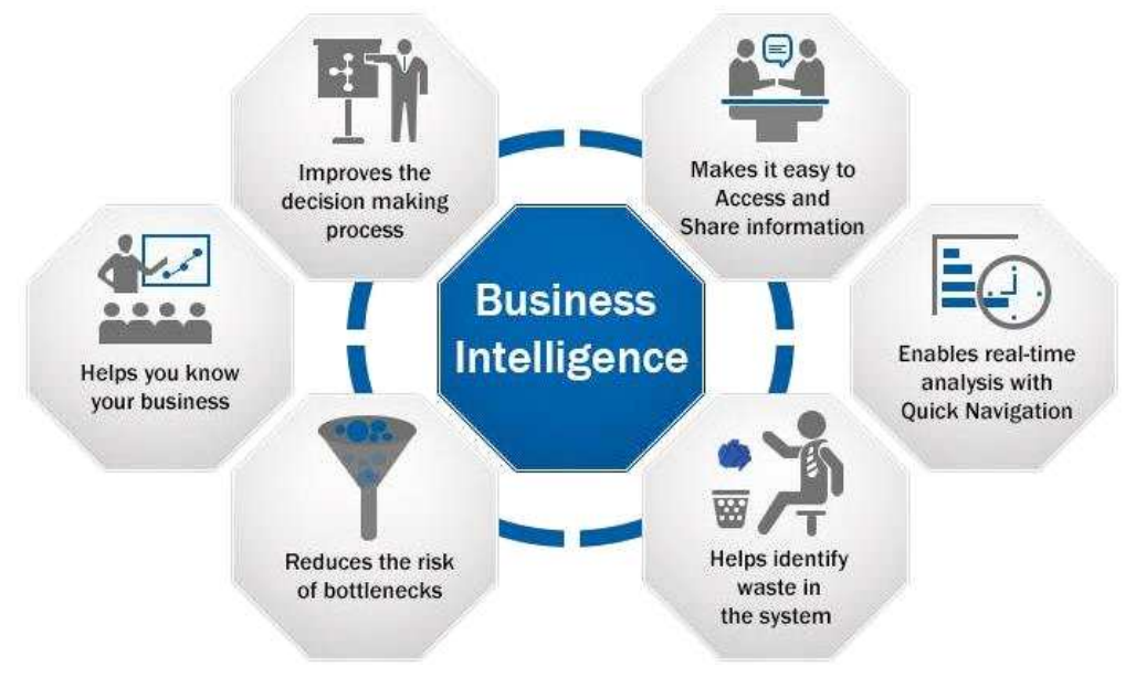
Fig. 2. The Capabilities of Business Intelligence

The origin of data analytics can be traced back to the early days of computer science and statistics, with roots extending to the mid-20th century. Data analytics emerged as a means to process and derive meaning from vast datasets, primarily driven by the increasing availability of computing power and data storage capabilities. Early pioneers like Florence Nightingale and William Playfair laid the groundwork for visualizing and analyzing data, while advancements in statistical methods and algorithms contributed to the evolution of data analytics (Yangzom & Ahuja, 2023; Omol et al., 2024). As highlighted by Davenport (2018), the digital revolution accelerated the field's growth, with the emergence of big data and advanced analytical techniques, including machine learning and artificial intelligence. This historical progression underscores the pivotal role of data analytics in modern times, where its application spans industries, guiding digital transformation by uncovering valuable insights, predicting trends, and driving informed decision-making across diverse sectors.