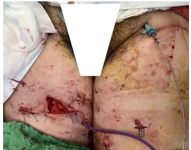
Fig. 2. Intraoperative insertion of resuscitative endovascular balloon occlusion of the aorta into the left femoral artery.