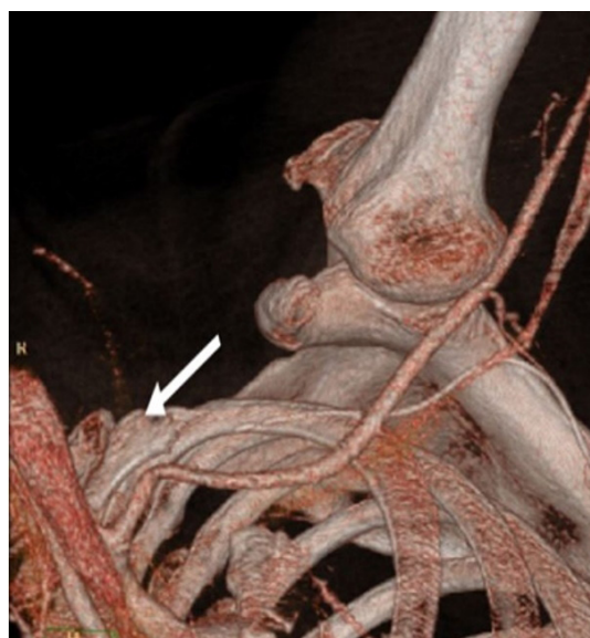
Fig. 3. Computed tomography angiography demonstrating the resolution of stenosis in the left proximal subclavian artery and the resection of the first rib (arrow).