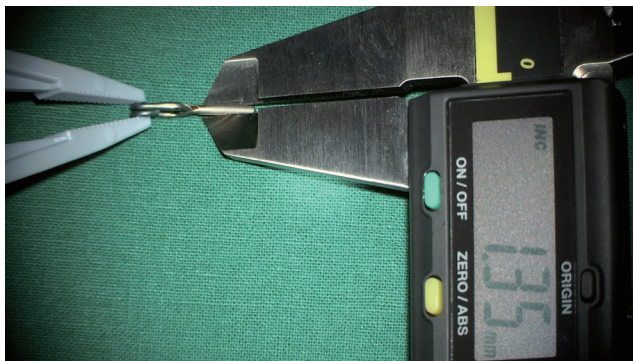
Fig. 3. Digital precision ruler to measure the thickness of the aneurysm clip blade.