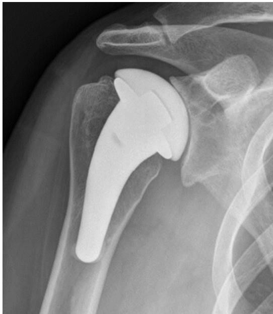
Fig. 2. An X-ray image of a pyrocarbon hemiarthroplasty implant.