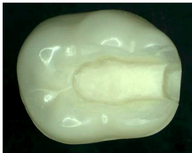
Fig. 1. Typodont mandibular right first molar with a class II disto-occlusal inlay preparation.

This study was conducted according to the experimental design outlined in Fig. 2. Specifically, epoxy resin (Struers, Copenhagen,