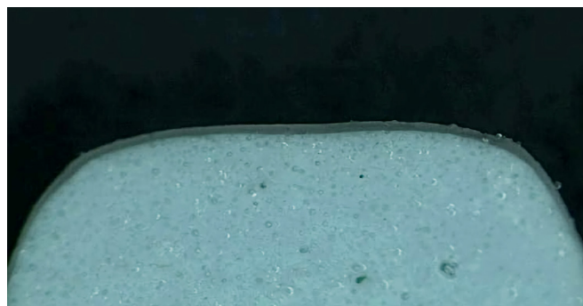
Fig. 3. Stereomicroscopic view of silicone replica section with internal discrepancy ( \times 40 ).

Bis-GMA, bisphenol A glycidyl methacrylate; TEGDMA, triethylene glycol dimethacrylate; UDMA, urethane dimethacrylate; Bis-EMA, bisphenol A polyethylene glycol diether dimethacrylate.