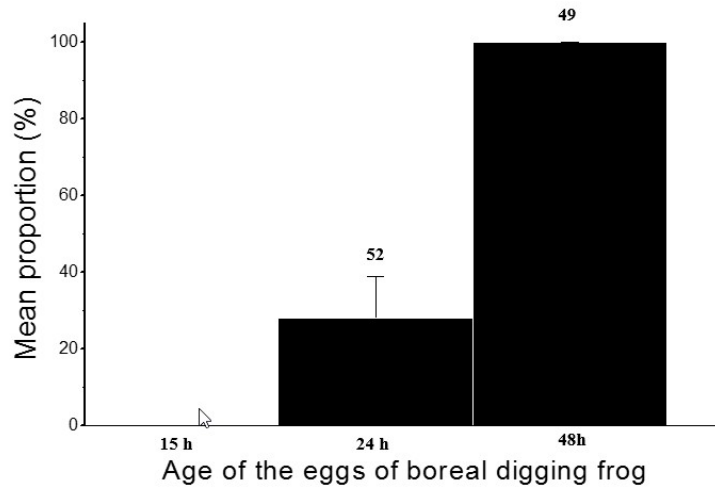
Figure 1. The mean proportion of hatching from eggs at 15, 24, 48 hours after spawning in boreal digging frog, Kaloula borealis . Mean S.D and the sample size is given above each bar.

early stages of egg development; no significant difference was noted between 24:01 and 48:00 h at both temperatures (Fig. 2).