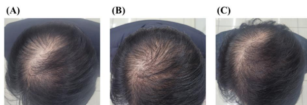
Fig. 2. Hair status at the vertex before and after nutrition therapy implementation: (A) before treatment, (B) one month after, and (C) two months after

Following the prescribed nutrition therapy for hair loss, gradual hair regrowth was observed at the vertex region over monthly evaluations (Fig. 2). Moreover, one month after starting the OCNT, the patient reduced his dosage of Dutasteride from once a day to once weekly.