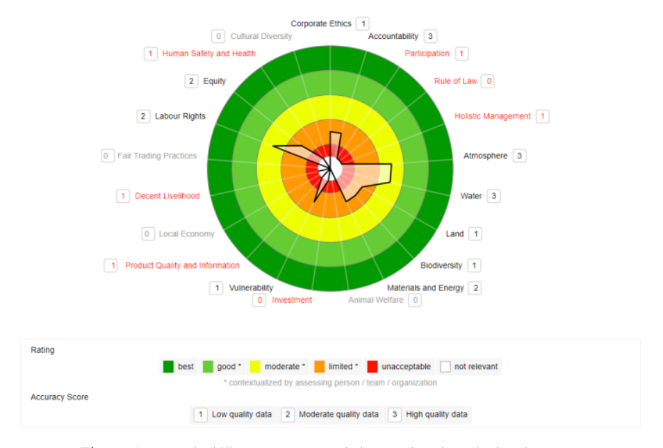
Figure 4a. Sustainability Assessment of the Food and Agricultural System Overall Performance for Worst-case Scenario

Under the worst-case scenario, sustainability performance exhibited severe deficiencies across governance, environmental management, and economic resilience dimensions. SAFA's