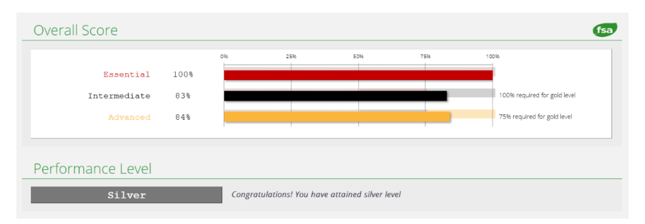
Figure 2b. FSA overall performance for best-case scenario

scenario, aligning with key sustainability goals. SAFA's polygon (Figure 2a) predominantly occupied the 'green' or 'dark green' regions, reflecting good and best ratings, respectively. Out of the 15 indicators assessed in SAFA polygon, 5 were marked in the green regions after excluding irrelevant indicators. This suggests notable strengths in specific areas such as labor rights, product quality, and accountability. However, it is important to clarify that the