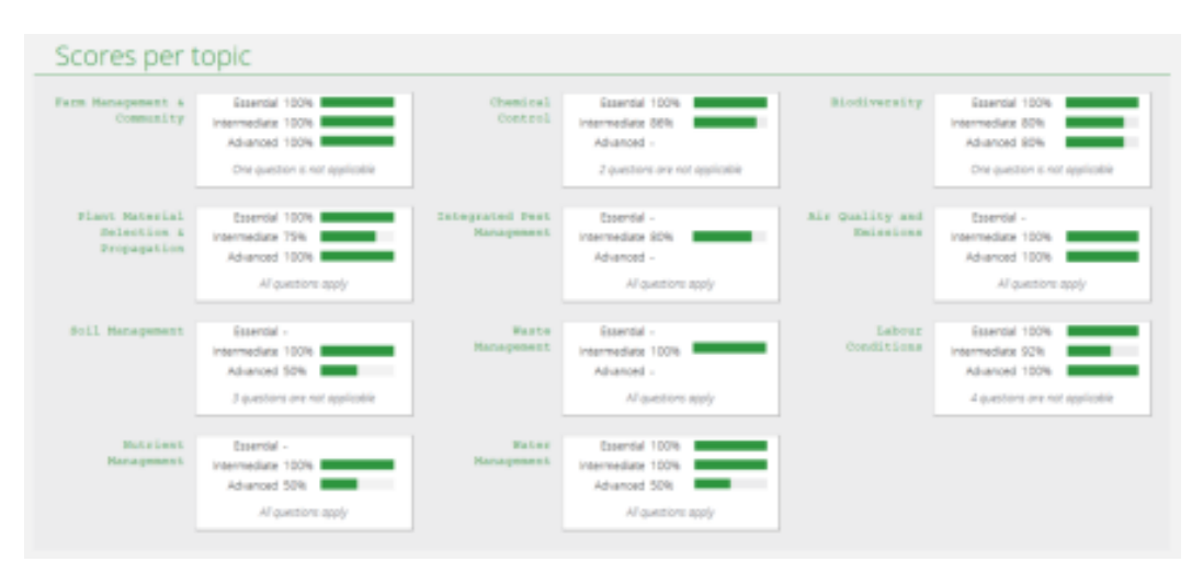
Figure 3a. Detailed Farm Sustainability Assessment Score for Best-case Scenario

While on the contrary for the social performance, the farm performed exceptionally well in labor rights, gender equity (with 70% of the workforce being female), and workplace safety, achieving high scores across all tools. Both SAFA and FSRT highlighted the farm's