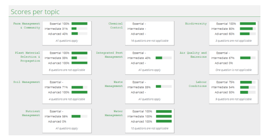
Figure 4c. Detailed Farm Sustainability Assessment score for worst-case scenario

polygon largely occupied the 'red' and 'orange' regions (Figure 4a), reflecting poor ratings in Corporate Ethics and Participation, both scoring 1/5. These results underscore inadequate governance, accountability, and stakeholder engagement. Environmental Integrity also suffered significantly, with particularly low quality and biodiversity ratings for air management, signifying the farm's failure to address climate effectively impacts or biodiversity preservation.