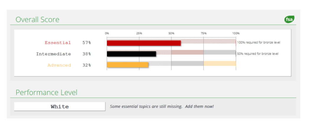
Figure 4b. Farm Sustainability Assessment overall performance for worst-case scenario