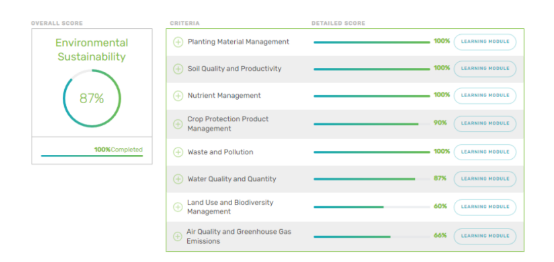
Figure 3b. Farm Sustainability Readiness Tool score on Environmental Sustainability for Best-Case Scenario