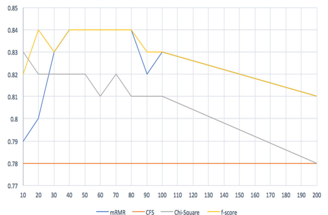
Figure 2 Four Feature Selection method comparison

The result obtained by mRMR and F-score outperform deep learning model Deep neural network DNN proposed by Park et al., [19] which gained 82% accuracy on the same gene expression dataset.