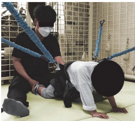
Fig. 1. Training for differentiated movements before crawling.

ball, independent standing, and gait training (Table 1). The goal of reciprocal crawling is to improve shoulder and core postural stabilization, weight-bearing (WB), weight shifting (WS) on the upper extremities (UE) and lower extremities (LE), and strengthening the elbow extensors, hip flexors, and extensors (Fig. 1). For reciprocal crawling, he was able to lift his trunk from the floor while WB and WS