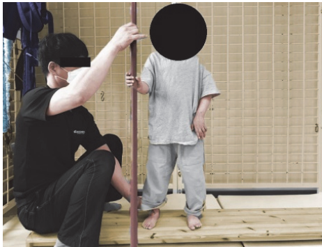
Fig. 4. Training for independent standing on a balance board.

the shortened hip internal rotation muscles and contract the elongated hip external rotation muscles (Fig. 3). To improve the child's standing balance strategy, he was trained for 30 minutes to use the ankle strategy on the movable balance board, using a movable platform capable of anterior-posterior displacements or dorsi-plantar flexion of the ankle joint (Fig. 4). The type of perturbation is an environmental condition that can affect the balancing strategy. The balancing response can be triggered by sensory input from an unpredicted perturbation (feedback activity) [11]. Finally, for independent gait, 30 minutes of gait training was conducted using an elastic cord (elastic cord, 8mm, YAMUZIN, Korea). An elastic cord provided the child with as little assistance as possible.