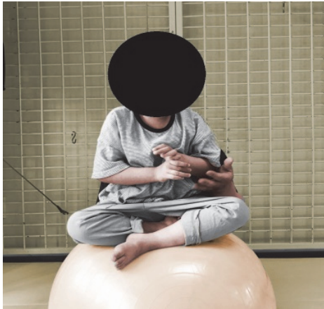
Fig. 3. Training for tailor sitting on a stability ball.