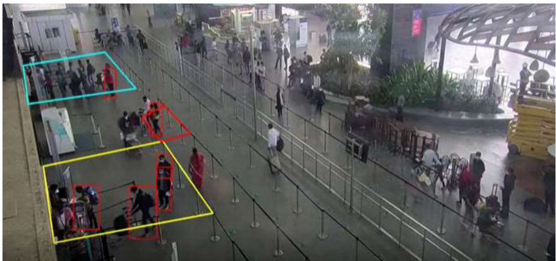
Fig. 5. Intelligent airport security cameras at Budapest Airport

After overcoming COVID-19 pandemic era, international airports are facing the challenge of having to check in the enormous number of passengers while, at the same time, guaranteeing the high level of aviation security standard.