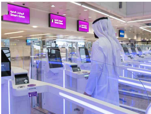
Fig. 1. Smart gate at Dubai International Airport using multiple biometric IDs

UN specialized agency, ICAO (International Civil Aviation Organization) has provided a specific guideline material in GASeP from