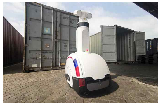
Fig. 4. AR+AI inspection robot at Guangzhou customs district

Another example using AI based robotics is a reform measure of Guangzhou Customs of China (Fig. 4). Guangzhou Customs District has been initiating the AR and AI technologies in