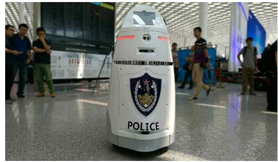
Fig. 3. Autonomous robot at Shenzhen Airport

"AnBot", or "Shenzhen Xiaolan" in Chinese, can move around and react to emergencies