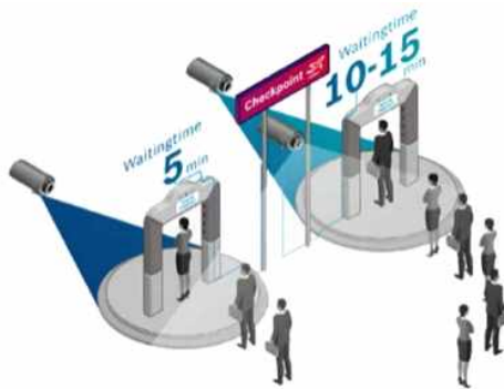
Fig. 6. Smart CCTV increasing efficiency of passenger traffic flow

Smart CCTV analysis with A.I. and IoT applying solutions could provide significant support for airport security.