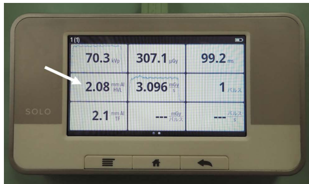
Fig. 1. The RaySafe X2 Solo DENT device is a semiconductor dosimeter used for intraoral radiography. The display of the dosimeter indicates a half-value layer (HVL) of 2.08 mmAl (arrow) for a 0.25-mm high-purity aluminum plate at 70 kVp.

A comparison of the aluminum plate thickness and HVL