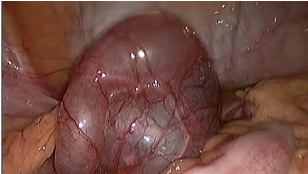
Figure 3. Laparoscopic appearance of the left hydrosalpinx as a big, convoluted, thin-walled cystic adnexal mass.