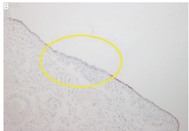
Figure 1. Histopathological findings of the specimen from the distal fallopian tube. (A) Stratified and thickened epithelial layer, focal loss of polarity and ciliated cells, lack of stromal invasion, enlarged nuclei, and hyperchromatic chromatin are visualized. Hematoxylin and eosin staining ( \times 200 ). (B) Total negative expression of p53 was observed (in the yellow circle). Scattered nuclear stain ( \times 200 ).