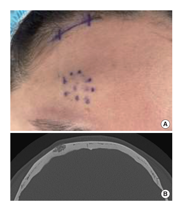
Fig. 1. A 35-year-old woman presented with a firm, immovable, and palpable mass on her right forehead. (A) Preoperative photograph. (B) Computed tomography (CT) scan without contrast. Axial CT scan showing a well-defined lesion containing prominent trabeculae. The inner table is intact, but the outer table is displaced and has irregularly scalloped margins. No sclerotic margins are evident. The hemangioma penetrated the outer table, and the mass of the forehead protruded.

able one. Both the patient and the surgeons were satisfied with the clinical outcome of a barely visible scar following the removal of the intraosseous hemangioma via a small anterior hairline incision. In this report, we share our clinical experience with the removal of a frontal bone hemangioma through an anterior hairline incision, which yielded satisfactory cosmetic results.