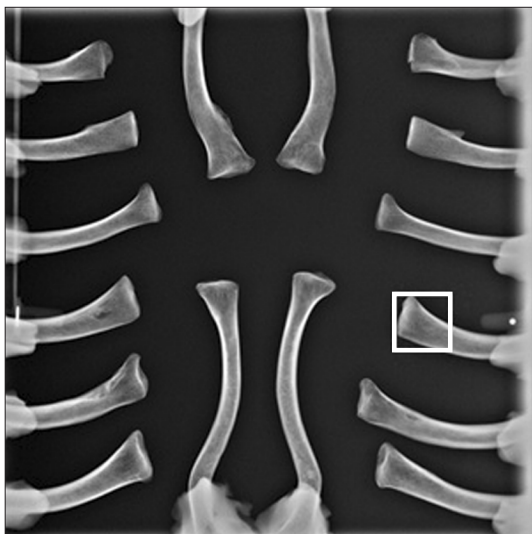
Fig. 1. The radiographs of 8 pairs clavicular samples, red box= 3 \times 3 cm 2 region of interest.

CNN which excels at image classification were used in this study [16]. A pre-trained network called GoogLeNet was adopted to minimize training duration and reduce the need for large amount of training data [17]. The loss3-classifier and output classification layer of the network were substituted with 'Fully connected layer' and 'The final class output'. Other parameters were adjusted based on data set characteristics. MATLAB R2021b (MathWorks, Natick, MA, USA) were used as the main platform of this study.