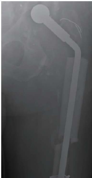
Fig. 3. First of two-stage revision with a cement spacer with antibiotics, two years after last DAIR (debridement, antibiotics and implant retention).

Two years after surgery, the patient suffered two episodes of prosthetic dislocation. Serum laboratory results showed WBC 13,700/mm 3 , ESR 35 mm/hr, and CRP 108 mg/dL. Due to instability and chronic wound infection, two-stage revision was performed, including placement of a cement spacer with antibiotics in the first stage (Fig. 3). Empirical IV meropenem 500 mg every 12 hours and trimethoprim 80 mg/sulfamethoxazole 400 mg were administered for two weeks. S. epidermidis was detected in the intraoperative cultures; a six-week course of teicoplanin 400 mg every 12 hours and ciprofloxacin 500 mg every 12 hours was prescribed by the infectology service. Two weeks later, the patient was hospitalized for fever and persistent wound drainage. Laboratory results showed WBC 11,240/mm 3 , ESR 25 mm/hr, and CRP 137 mg/dL. A new surgical debridement was performed and the spacer was kept in place. The presence of E. coli was detected in intraoperative cultures. During his hospital stay, the patient developed deep vein thrombosis and intestinal ischemia that required resection of the transverse and small colon. He was then transferred to the intensive care unit (ICU) in order to undergo further treatment. Due to persistent signs of infection, additional