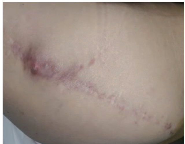
Fig. 6. Latest patient control, with no signs of wound infection.