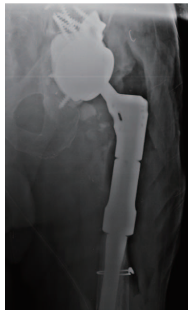
Fig. 4. Second stage of re-implantation arthroplasty with a femoral tumor stem and uncemented porous tantalum cup created with three-dimensional printing, two years and three months after patient discharge.

Two years after discharge, the patient was readmitted due to a reactivation of his chronic wound infection; symptoms included fever, fistulous lesions, and purulent spontaneous drainage. Laboratory results showed WBC 7,611/mm 3 , ESR 47 mm/hr, and CRP 36 mg/dL. A revision of the cement spacer, antibiotic-loaded with vancomycin and liposomal amphotericin B, was performed. The presence of methicillin-sensitive S. aureus , E. coli , and Acinetobacter baumannii was detected in cultures. Three months after the initial revision, once the markers of inflammation had normalized and in the absence of clinical signs of infection, the second stage of the re-implantation arthroplasty procedure was performed using a femoral tumor stem and an uncemented porous tantalum cup created with 3D printing (Fig. 4), in order to address the acetabular defect. However, five months after surgery, the patient experienced another episode of dislocation and reactivation of his chronic infection. Laboratory results showed WBC 8,455/mm 3 , ESR 32 mm/hr, and CRP