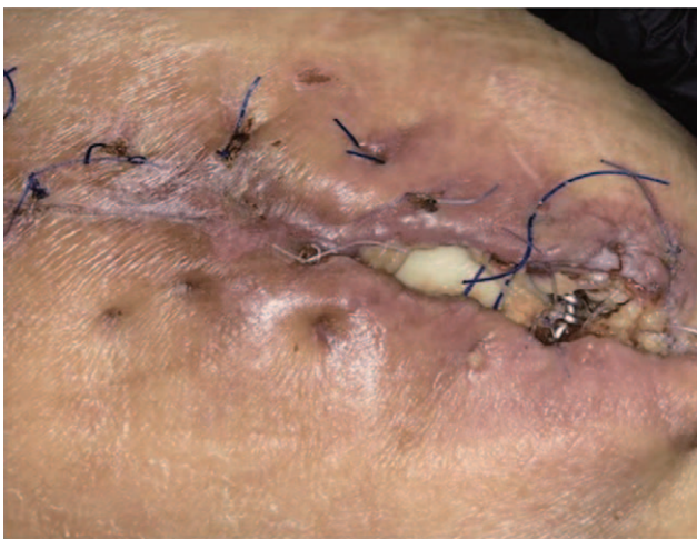
Fig. 2. Infected patient wound, fifteen days after one time revision.