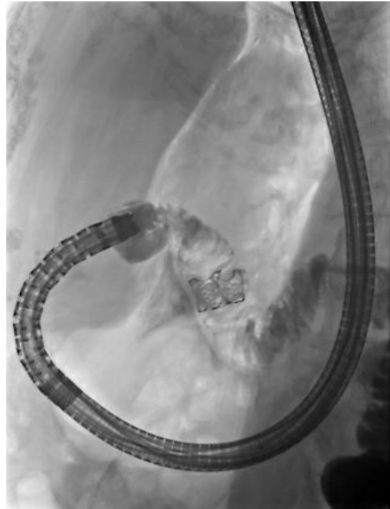
Fig. 3. No further contrast leak was noted after placement of the second over-the-scope clip.

denum by Hyun et al. 41 More recently, Zhang et al. 42 described the use of a novel through-the-scope suturing device to close iatrogenic duodenal defects, potentially obviating the additional step of removing the endoscope from the patient to affix the device. Surgical repair is required immediately in cases where endoscopic measures fail. In a retrospective study, 50 out of 380 patients with ERCP-related perforations required surgery. Forty