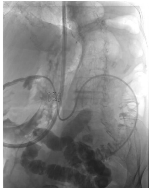
Fig. 4. Nasojejun tube was inserted for suctioning to reduce the secretions traversing the region of the repaired perforation, as well as to ensure continuation of enteral nutrition.