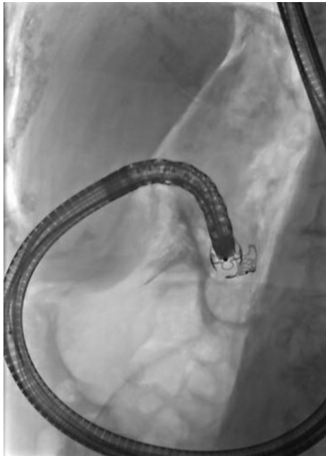
Fig. 2. Contrast leak was noted after deployment of one over-the-scope clip, indicating that defect was not completely closed.

denum by Hyun et al. 41 More recently, Zhang et al. 42 described the use of a novel through-the-scope suturing device to close iatrogenic duodenal defects, potentially obviating the additional step of removing the endoscope from the patient to affix the device. Surgical repair is required immediately in cases where endoscopic measures fail. In a retrospective study, 50 out of 380 patients with ERCP-related perforations required surgery. Forty