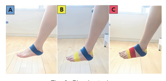
Fig. 2. Placebo taping.