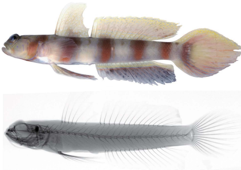
Fig. 1. Fresh specimen (above) and its X-ray radiograph (below, reverse image) of Amblyeleotris japonica , NIBR-P0000080204, 70.5 mm SL, collected from southern Jeju Island, Korea.