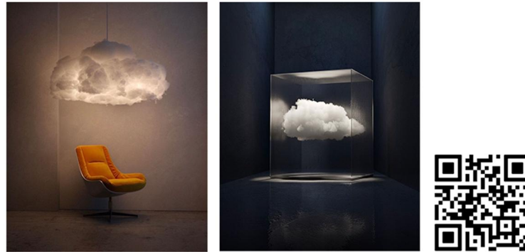
Figure 3. Artificial Light Contents

Furthermore, the use of artificial lighting can help artists create special effects such as projections, shadows, and reflections. These effects enhance the realism and visual appeal of the scene, making digital artworks more vivid and captivating. Using artificial lighting in Unreal Engine is a powerful tool in the creation of digital artworks, enabling artists to craft distinctive visual effects and emotional experiences, enhancing the expressiveness and allure of the digital artworks.