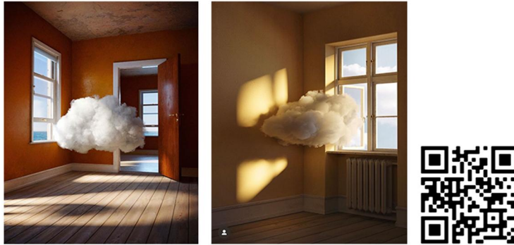
Figure 1. Natural Light Contents - Indoor

artificial lighting, which saves digital artists time and effort.