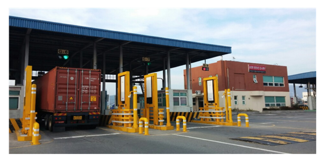
Fig. 2. Radiation portal monitor at a Korean airport.

inspections on industrial products according to the decision from the 76<sup>th</sup> National Policy Coordination Conference held on March 25, 2011, after the Fukushima nuclear power plant accident. According to the responsibilities and roles specified in the working manual for the emergency response to radioactive leakage accidents in neighboring countries issued by the NSSC, the KCS implements radiation monitoring for imported cargo [3]. The KCS conducts a selective radiation inspection of industrial products imported from and near the nuclear accident area in Japan. It reviews the radioactive inspection certificates issued by other government departments to verify customs clearance.