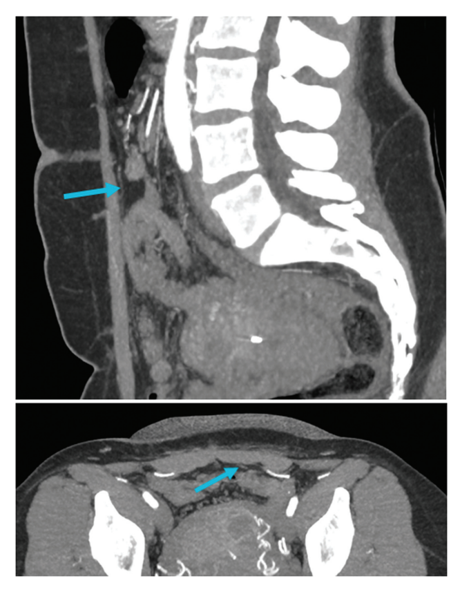
Fig. 1 Computed tomographic angiogram (CTA) axial slices demonstrating a peritoneo-cutaneous perforator (blue arrows).

perforators that appeared suitable for a perforator flap. These peritoneo-cutaneous perforators identified on preoperative imaging were confirmed intraoperatively ( -Fig. 2 ). During initial flap dissection and raising, multiple perforators supplying the lower abdominal wall bilaterally were seen to originate deep to the posterior rectus sheath. The course of the largest of these perforators was dissected, and was confirmed to traverse the extraperitoneal fat, posterior rectus sheath, rectus abdominis muscle, and subcutaneous tissue, and had no direct communication with the DIEA. Ultimately, bilateral DIEP flaps were raised bilaterally, and all identified peritoneo-cutaneous perforators were clipped and ligated, with successful flap transfer and no complications.