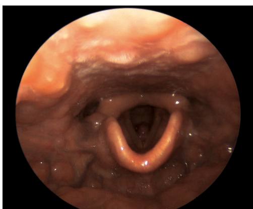
Fig. 1. Preoperative laryngoscope. A round, pinkish mass, approximately 1 cm in size, was observed anterior to the left vocal fold.

On histopathological examination, the tumor was 1.2 x 0.9 cm in size, and hematoxylin and eosin staining revealed that the tumor was composed of spindle cells. The resection margin of the tumor was indeterminate in pathologic report. The cells stained positive for CD99 and BCL2 and were focally positive for TLE1 (Fig. 3).