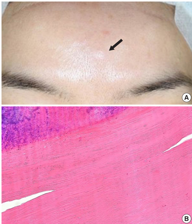
Fig. 2. (A) A 54-year-old woman with pedunculated frontal osteoma (arrow). (B) Microscopic findings show fused thick lamellated bone trabeculae (hematoxylin and eosin stain, \times 200 ).

diagnosis from osteblastomas, osteoid osteomas, odontomas, and focal sclerosing osteomyelitis [10].