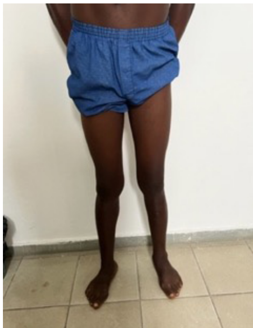
Fig. 4. Standing limb appearance at 20-month posttreatment. Note the right valgus knee.

crine pathologies. Our patient had no notable medical history, suggesting that the bilateral detachment was likely due to the injury mechanism of direct back-to-front impact in a standing individual with late physeal fusion. Closed reduction using external movements and pinning is the treatment method most commonly recommended to minimize the risk of complications [7–10]. However, this closed-focus approach should be performed promptly to ensure its effectiveness. The relatively long delay in managing the patient necessitated an open reduction and pin-