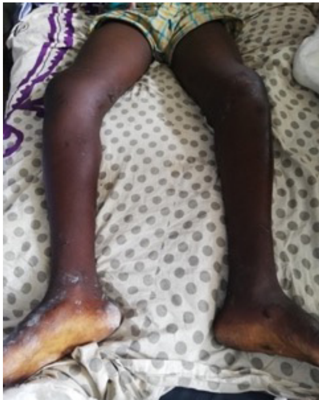
Fig. 1. Frontal view of the pelvic limbs. Note the swelling associated with abduction and external rotation.

No attempt had been made at reduction prior to the patient's admission to our unit. Routine laboratory tests and blood calci-