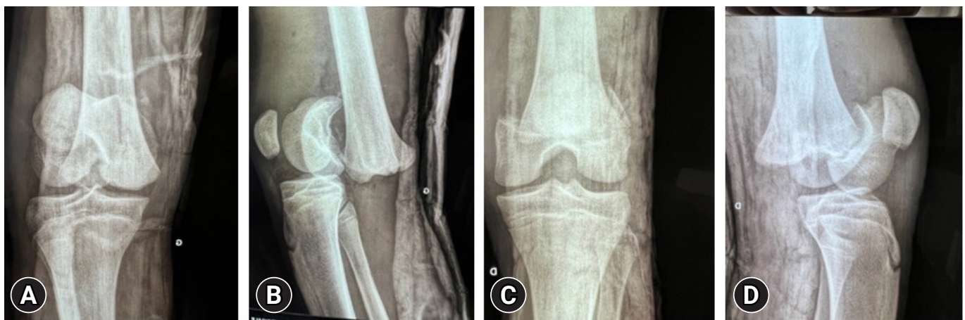
Fig. 2. Knee x-rays depicting epiphyseal lesions. (A) Frontal and (B) lateral x-ray of the left knee displaying a Salter I distal femoral epiphyseal detachment. (C) Frontal and (D) lateral x-ray of the right knee displaying a Salter II distal femoral epiphyseal detachment.

Epiphyseal detachments and fractures are common injuries in children and adolescents [4,5]. Few cases have been reported of bilateral femoral epiphyseal detachment in healthy young adults. In adults, these injuries are typically associated with metabolic disorders [6]. Peterson et al. [4] described two cases of epiphyseal detachments in patients over 20 years old, but both had endo-