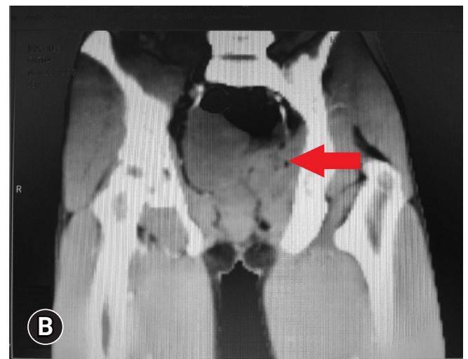
Fig. 1. (A, B) Abdominal computed tomography scan displaying pelvic hematoma and contrast extravasation (arrows).