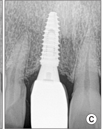
Fig. 2. Radiographic results of implant placed in horizontally augmented ridge using porcine bone grafts. A. Immediately after the operation. B. Immediately after the prosthetic restoration. C. Final follow-up.

Jin-Won Choi et al: Horizontal ridge augmentation with porcine bone-derived grafting material: a longterm retrospective clinical study with more than 5 years of follow-up. J Korean Assoc Oral Maxillofac Surg 2023