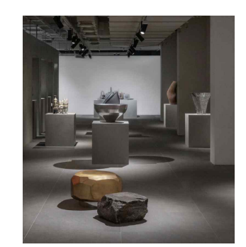
Figure 5. View of the 2022 Loewe Craft Prize Exhibition