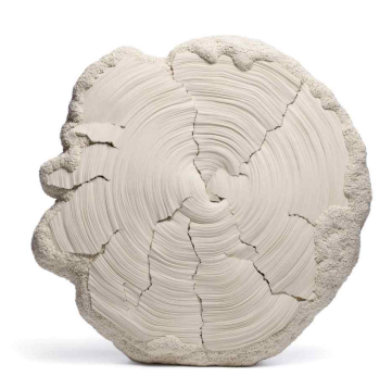
Figure 13. Croissance XL(XL Growth) (www.loewe.com)