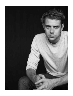
Figure 3. Jonathan Anderson (www.loewe.com)

The case analysis shows that among the finalists, many crafts are based on the traditional values of traditional textile crafts by utilizing traditional techniques. Figure 6 shows a work woven from a unique material called horsehair, using a 500-year-old hat-making technique. This work was highly praised for revitalizing a tradition