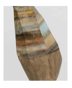
Figure 10. Strada Detail