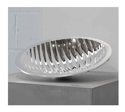
Figure 4. Trophy for the Loewe Craft Prize Winner (www.loewe.com)