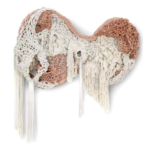
Figure 7. Matriarchal Womb (www.loewe.com)