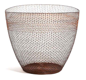
Figure 6. A Time of Sincerity (www.loewe.com)