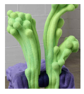
Figure 12. Chair11 Detail