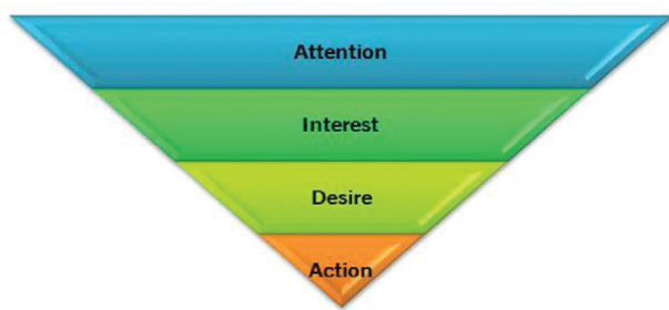
Figure 3: AIDA Model