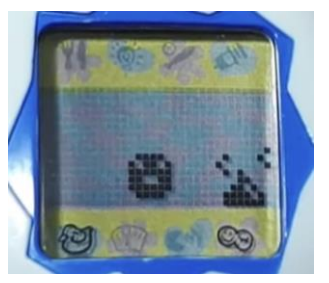
Figure 3. Tamagotchi character eating and defecating[6]