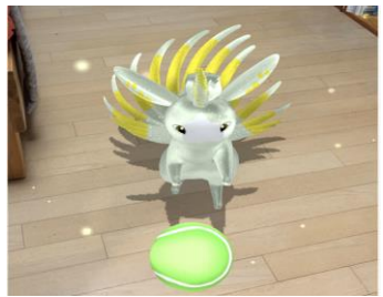
Figure 5. Peridot reacts to the ball and retrieves the thrown ball