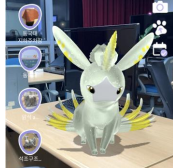
Figure 6. Peridot on a bed and desk in the real space on a mobile device screen