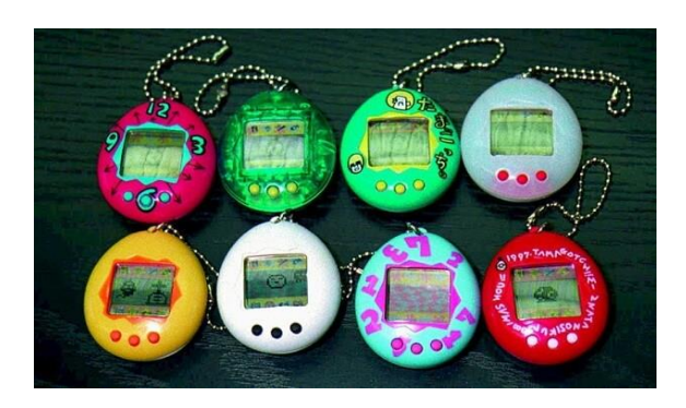
Figure 1. Tamagotchi model[5]

'Tamagotchi (2023)' is an electronic pet content invented by Japan's Aki Maita in 1996 and released by electronic game device company Bandai after purchasing the idea. It is a bitmap contained in electronic devices. It is a character development game machine designed to allow users to raise and play with their own pets. Starting from an egg state, once the character hatches, you must provide staple food and snacks, clean up excrement, and play with it. The character grows according to the owner's faithful upbringing. 'Tamagotchi Plus', developed in 2004, was equipped with an infrared communication device, enabling communication with other players (fighting between Tamagotchis, exchanging gifts, etc.).[4] Since then, various versions of Tamagotchi have been used for play, communication, and communication. It was released with various features updated, such as display, and recently released products appear to have been produced with a color screen.