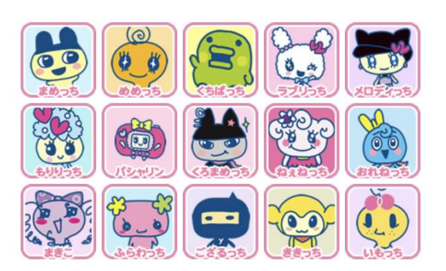
Figure 2. Tamagotchi characters

The character's growth stages consist of egg \rightarrow infancy \rightarrow childhood \rightarrow adolescence \rightarrow adulthood. In the case of the recently released model, some of the names have been changed from egg \rightarrow infancy \rightarrow rebellious stage \rightarrow puberty \rightarrow friend stage. The cute design is maintained from infancy to adulthood. The character's growth may change depending on care misses, changes in food, items, and affection (or happiness).