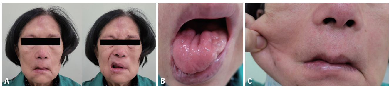
Fig. 2. Photograph of the patient showing marked facial diplegia (A), an atrophic and furrowed tongue (B), and lax skin (cutis laxa) on the cheek (C).