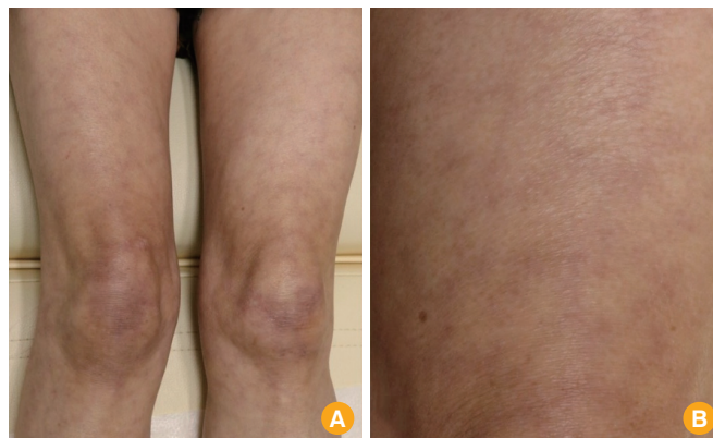
Fig. 2. (A) Dark violaceous reticular patches on both legs that occurred nine days post ChAdOx1 nCoV-19 vaccination. (B) Close-up of the net-like skin rash on the left thigh.

A 62-year-old Asian woman visited Inje University Sanggye Paik Hospital with dark violaceous reticular patches on her legs (Fig. 2A, B). She had the first dose of ChAdOx1 nCoV-19 vaccination 10 days prior to her visit to our hospital. The skin rash with violaceous net-like patches was observed nine days after her vaccination—the day before her presentation to our hospital. The skin rash was asymptomatic. She had previously been diagnosed with osteoporosis, but she did not take any medication for it. Her family history was unremarkable, and she denied any history of cold exposure. Laboratory tests—