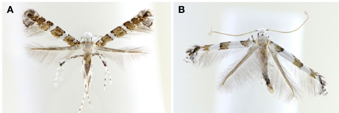
Fig. 1. Adults. A, Telamoptilia grewiae ; B, T. tiliae .

Dark ochreous to fuscous forewing ground color with blackish edged white fasciae; darker and more fuscous costa basal margin than ground color; first fascia reaches the wing fold; second fascia reaches just before median to base and third fascia distal to median; two whitish strigular on costal and dorsal margin with black edges; 4–5 white spots along apex to tornus and black apex; gray ochreous cilia on the outer