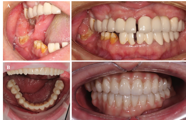
Fig. 2 (A) The tumor spread in the oral cavity. (B) 1 year postoperatively.

cervical lymph nodes, T4acN1M0, stage IVa, grade group II. Tumor size was 52 × 53 × 82 mm.