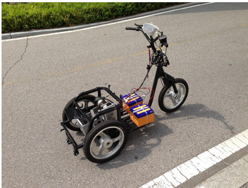
Figure 3. Small electric vehicle equipped CVT system using spring