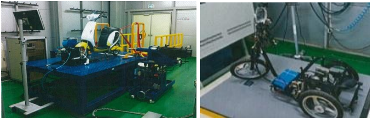
Figure 4. Small electric vehicle on the dynamometer

The figure of installing a small electric vehicle equipped with a CVT system using spring in a dynamometer is the same as Figure 4.