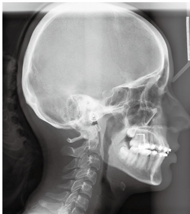
Fig. 1. A sample of a lateral cephalometric radiograph that was considered as the network input.

The images were used without mentioning the names and details of the subjects and kept confidential by the researchers. The present study was approved by the ethics committee of Hamadan University of Medical Sciences with the code IR.UMSHA.REC.1398.1048.